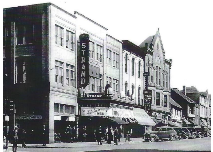
The Strand Theater at Edleman's Corner